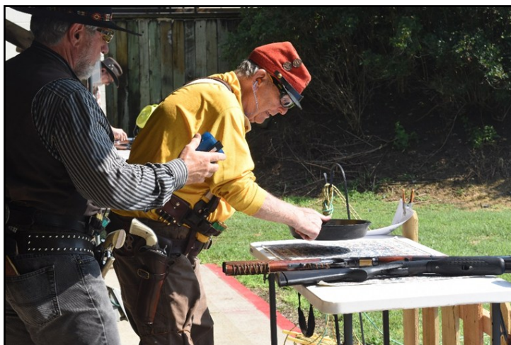
Rodent getting ready to drop the pan. The sun was hot and so was the danged pan!

Our clean shooters for the match were Old Doc Potter and Slow Gin Ricky .