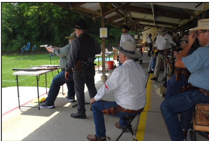
Honest Abe , Keeping the stage honest.