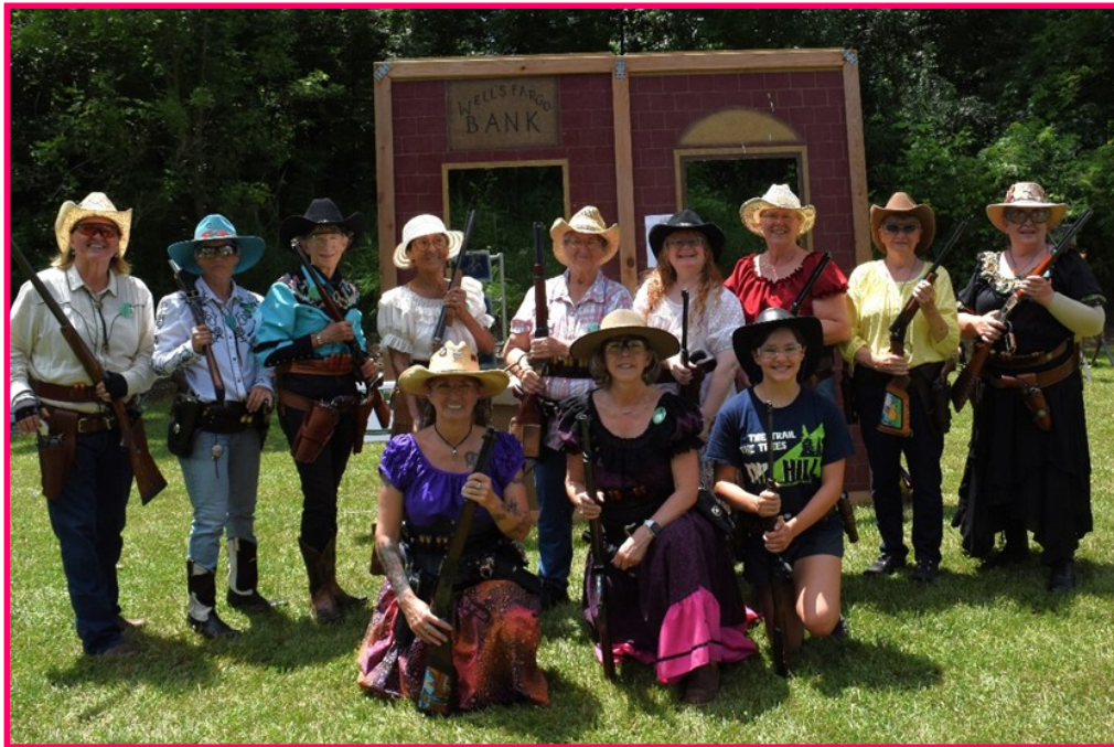
The Ladies of the Annie Oakley Match