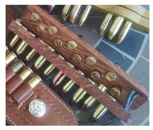
Cardshark Charlie makes a folding block that is very efficient (small) that I also like.

Missouri Marshal makes a very popular oval shaped block with a personalized leather flap the rotates out of the way when opened as shown in the picture on the left.