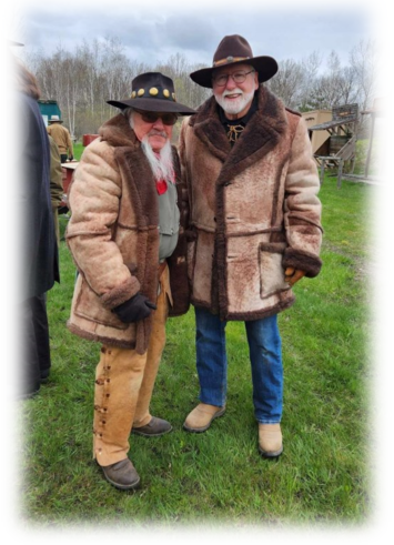
Smooth is fast Riverview Rattler, Chica, & Diabla

Don't forget to mark your calendars for our Camping and Shooting Extravaganza the third weekend of August...we'll again shoot our Old School shoot on Friday and Regular Shoot on Saturday...camping is free...come Wednesday thru Sunday and join in on the fun!