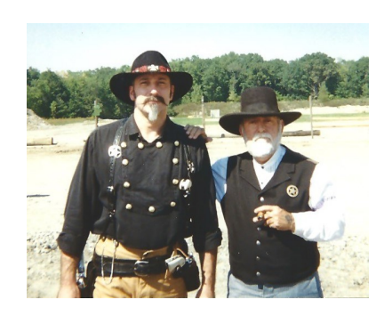
Nevada Gambler with Judge Roy Bean