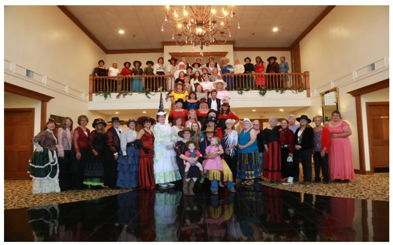
Service Men and Women—Range War 2017