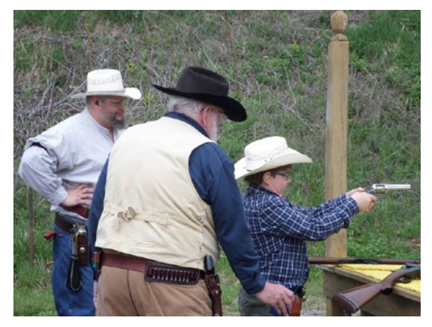
Thankfully, the rain held off for the duration of the match, and the last two stages were shot in the sun-shine.

Rusty's Cantina reopened right on schedule for our first match of the year in April after being closed for renovations last fall.