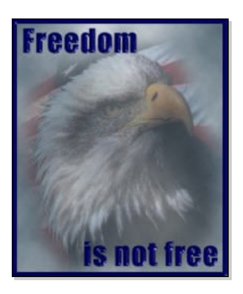
RO-I CLASS CHANGE

SASS has made a change on teaching RO-I classes. Basically, if any RO II (orange pin) wants to teach an RO I class, they must have an RO II Instructor (black pin) in attendance in the class. There will be new information on this in the near future. This will give our clubs a head start on what is coming. We can be contacted, if there are questions, at docand-kay@yahoo.com or 817-773-0637.